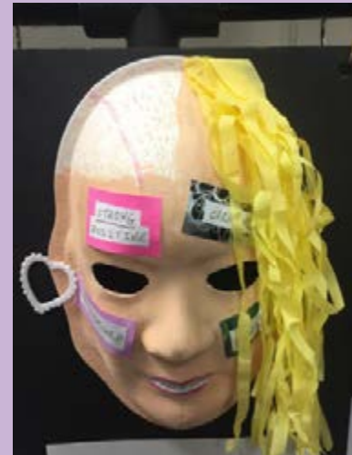
A few of the masks on the Traveling Exhibit.